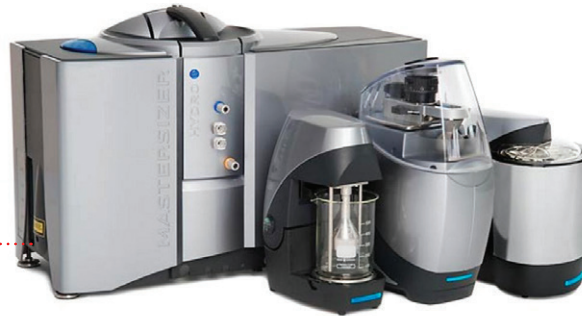
Malvern - Mastersizer 3000