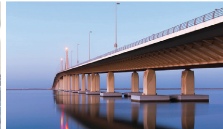
CONSTRUCTION & LOGISTICS