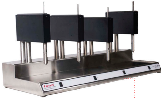
Linear Shale Swell Meter – LSM 2000