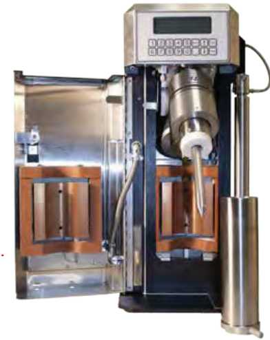
Fann 90 - Dynamic Filtration System