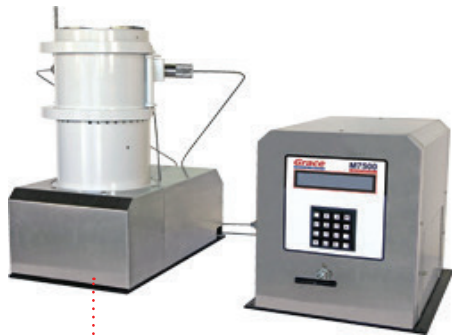
GRACE M 7500