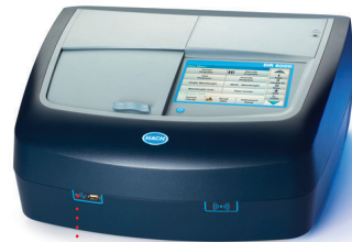
HACH DR 6000