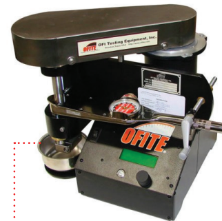
OFITE - Lubricity Tester